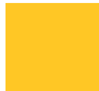
2 - yellow