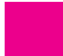
6 - pink