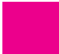
7 - fuchsia