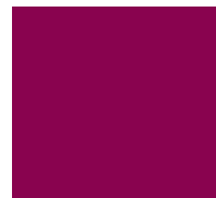
5 - bordeaux